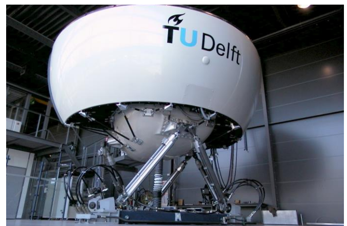
Figure 2: Simona Research Simulator.

The tests were performed on the research simulator SIMONA at the Faculty Aerospace Engineering of the University of Technology in Delft.